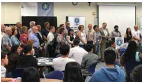
More than 50 business leaders assist youth with business plans