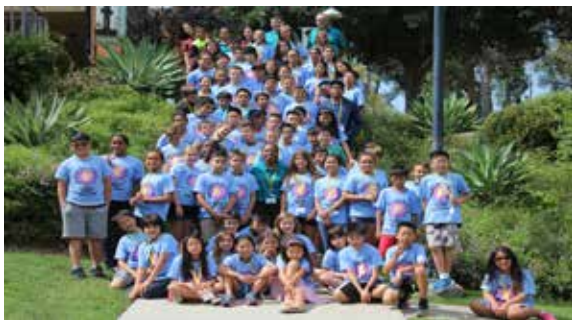
Kid Entrepreneur Academy (KEA) 2016 Class