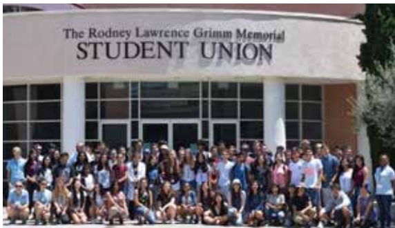
Teen Entrepreneur Academy (TEA) 2016 Class