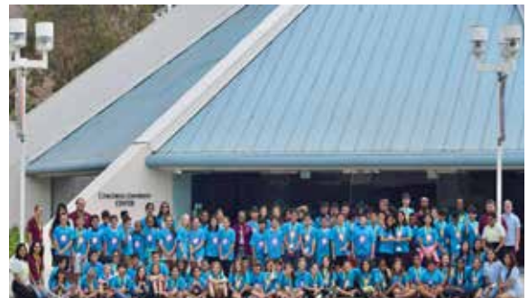
Teen Entrepreneur Academy (TEA) 2017 Class