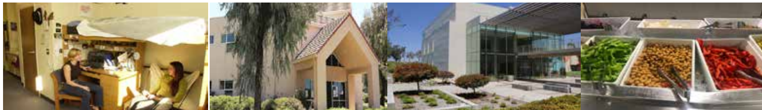
Live on a college campus: Dorm Room

The innovative AEA Summer Business & Leadership Academy offers excellent education to students through a creative 2-week American experience. Attending AEA provides a college academic program sponsored by Concordia University Irvine's prominent School of Business along with a cultural and American lifestyle experience. Courses are taught by distinguished university professors and successful business owners/entrepreneurs, combining lectures with hands-on workshops, group activities and field trips throughout Los Angeles.